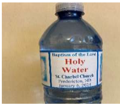
Holy Water available for pickup, was blessed January 6 & 7 during Epiphany' Masses.