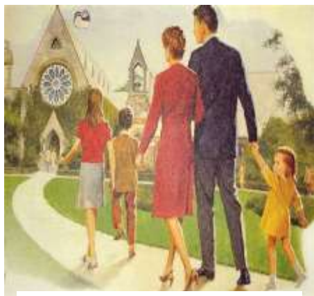
Family Prayers Sunday Mass

The 2024 Offertory Envelopes are now available at the entrance of the church. Please advise the office of any change to your address. There are envelopes for the new users, please verify the number. Thank you for your kind generosity