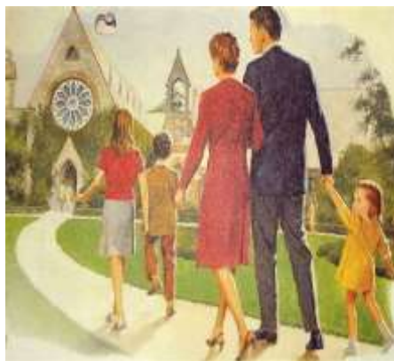
Family Prayers Sunday Mass