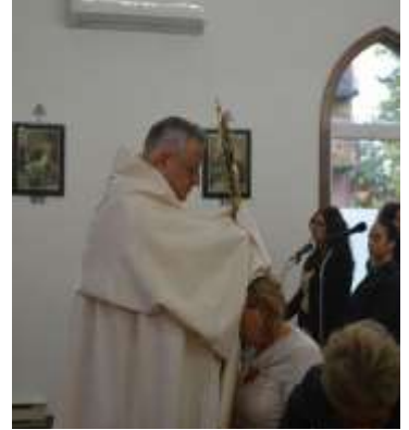
Commemoration of Saint Charbel on the 22 nd of each Month